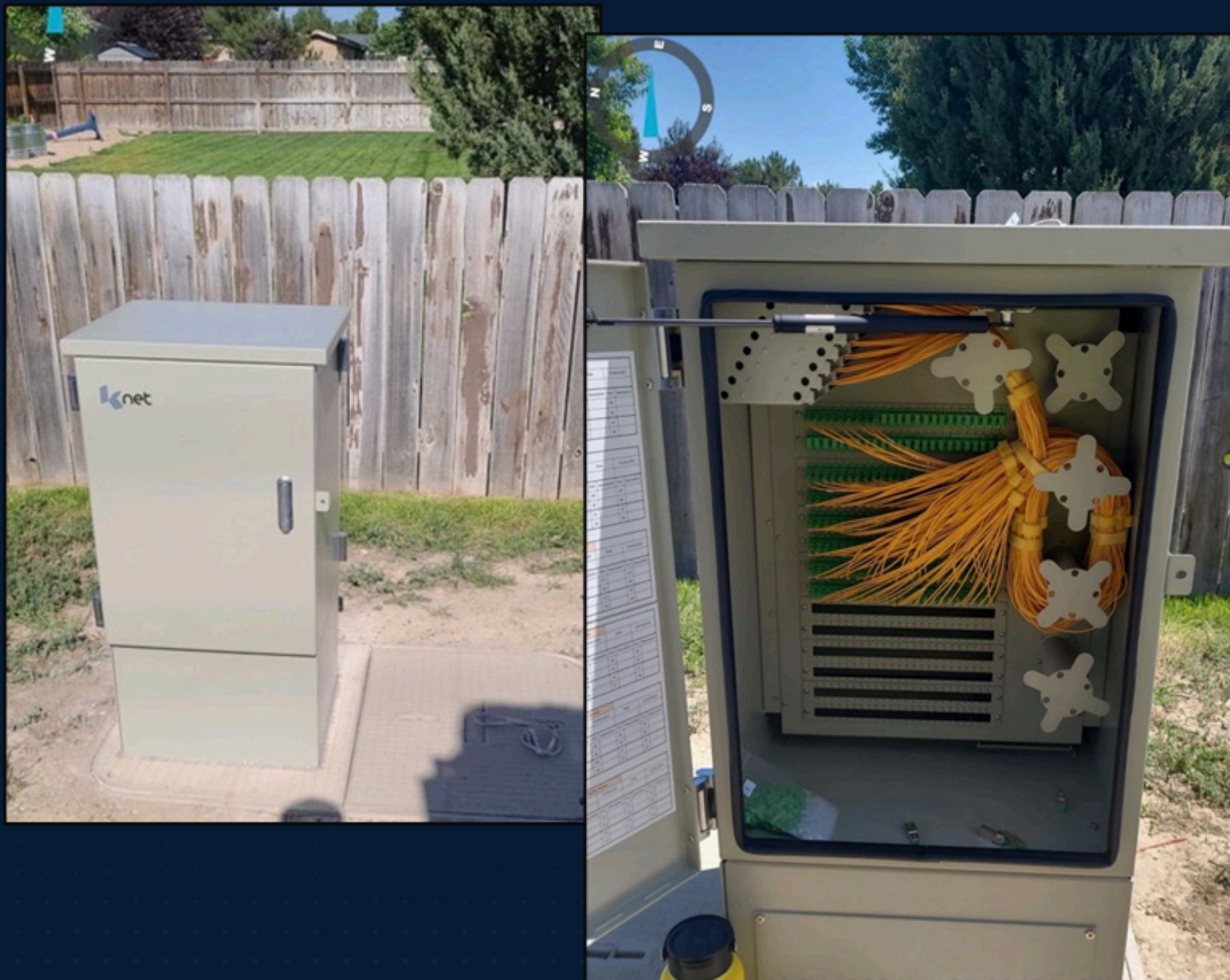
FDH( Fiber Distribution Hub) Model # : K-ridgeHUB 144/288C

Complete solution for managing up to 432port distribution fibers for an outside plant FTTx PON application. Cabinet incorporates a modular design, allowing the provider to repair or replace a damaged cabinet, without disrupting existing service. Cabinet includes a new pyramid shaped roof/solar shield and venting ports, providing additional protection for deployed fiber. Mounting options pad/vault mounted with either a 300mm/12" riser.